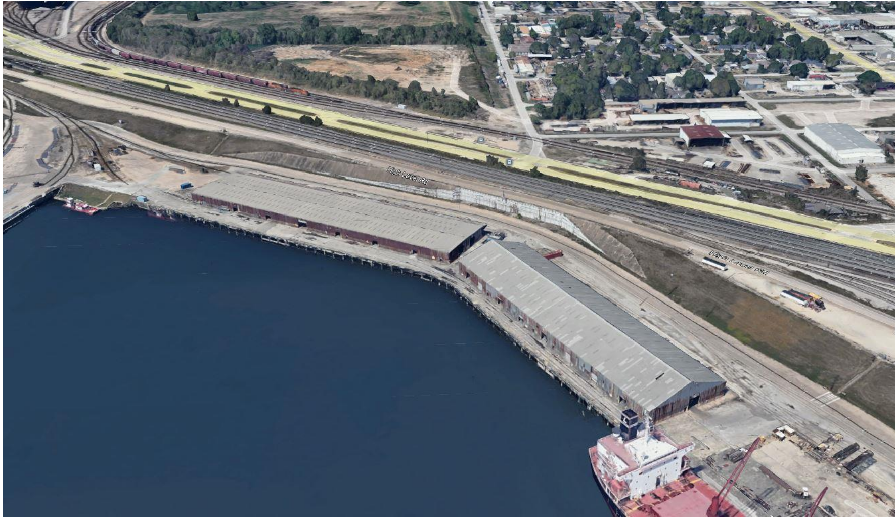
Transit Sheds 10-11