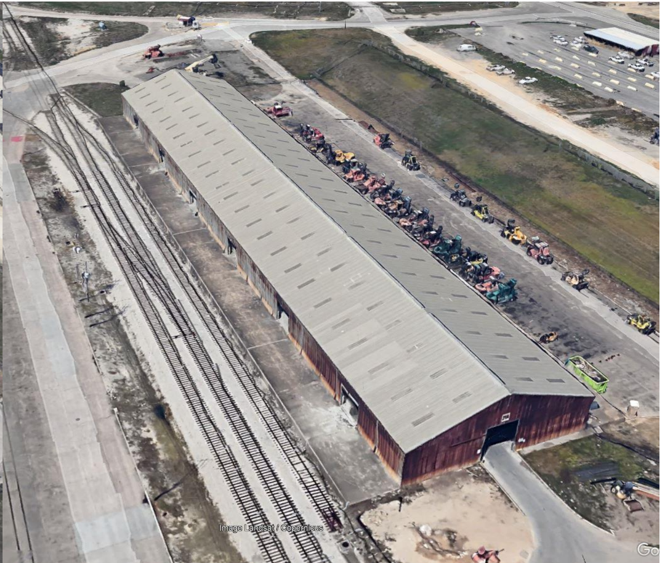
Transit Sheds 21A & 25A