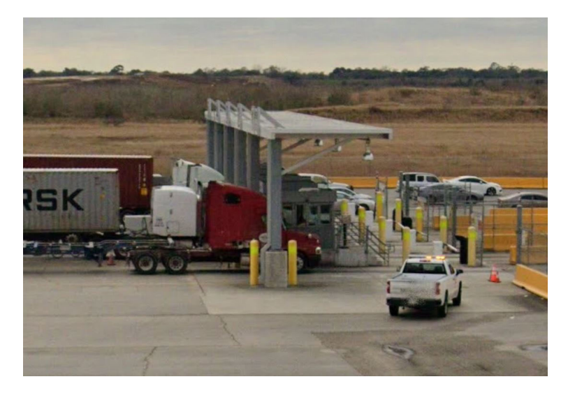
Existing TWIC Canopy