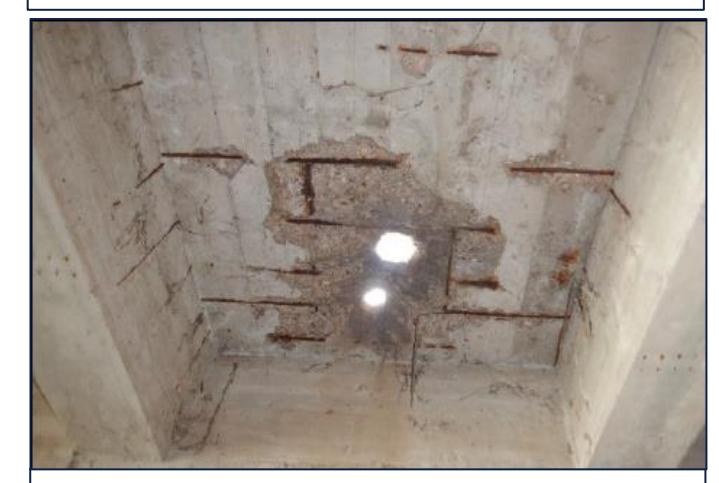
CD48, deck underside with holes and exposed reinforcing with severe corrosion