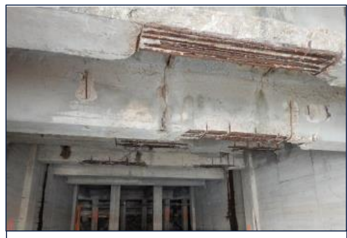
CD48, deck beams with severe cross-sectional loss due to corrosion

CD47, spalling and deterioration of concrete pile