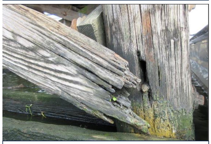
Timber brace with severe decay