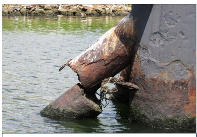
Broken steel batter pile