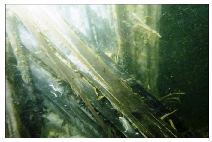
Timber pile with severe abrasion at waterline