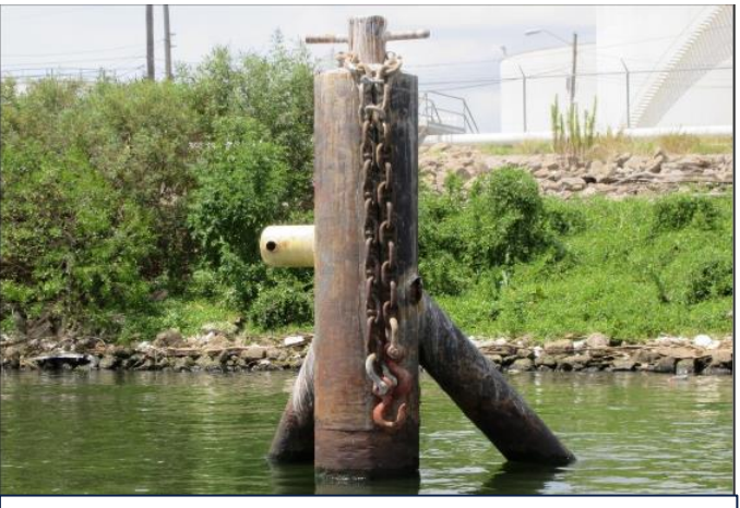
Breasting dolphin missing four fender units