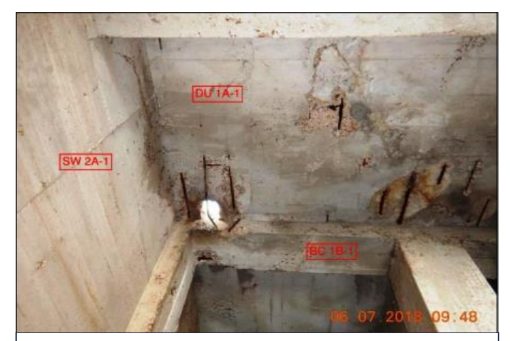
CD47: Bay 1, deck underside with corroded reinforcing and one hole