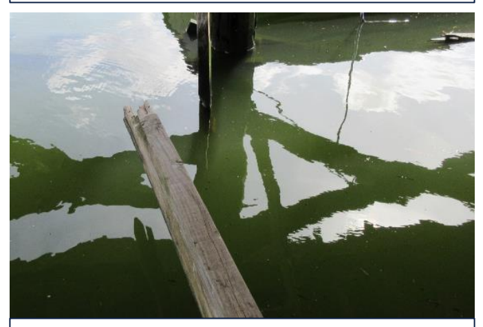
Broken timber brace