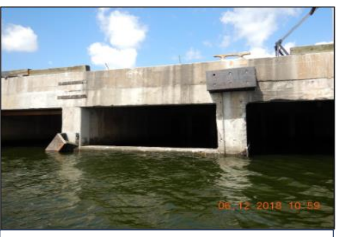
CD48, 1 fender with severe distortion and two missing fenders