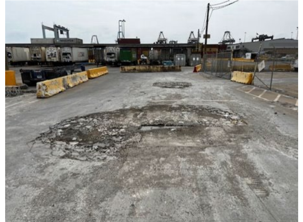
Img.1 - Typical Paving Condition Scenario