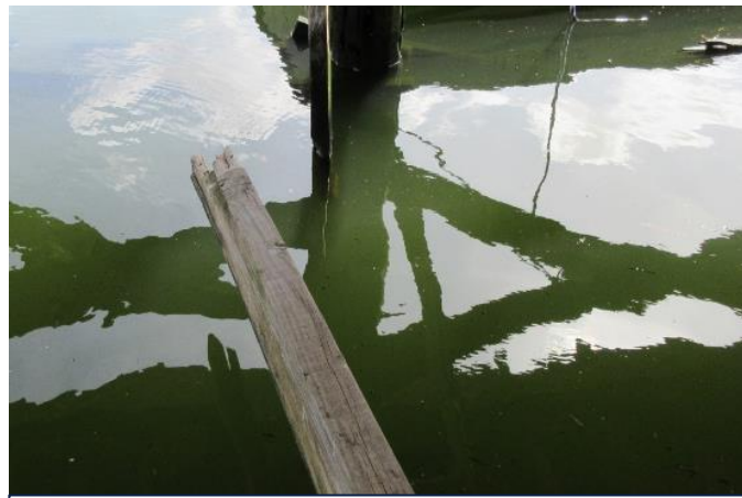
Broken timber brace