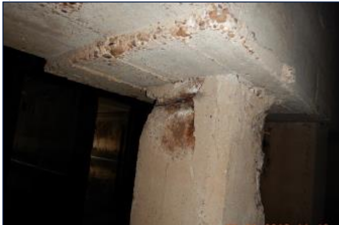
CD47, spalling and deterioration of concrete pile