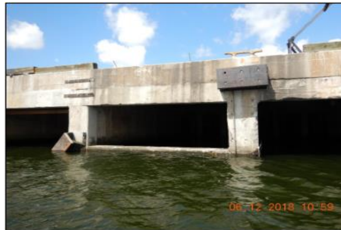
CD48, 1 fender with severe distortion and two missing fenders