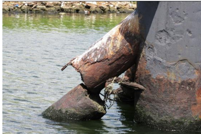
Broken steel batter pile