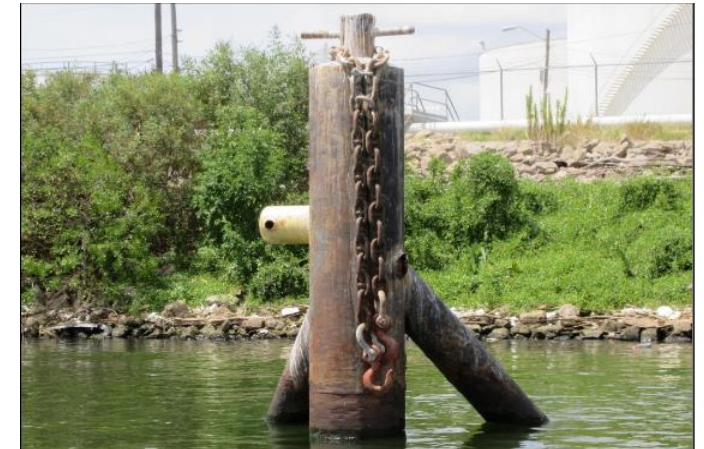
Breasting dolphin missing four fender units