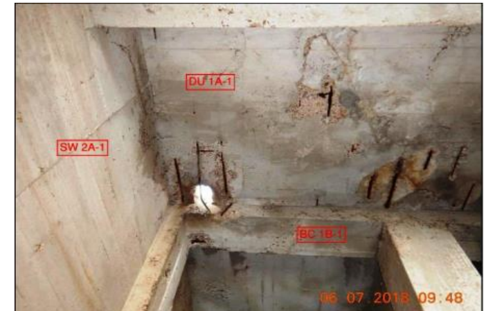
CD47: Bay 1, deck underside with corroded reinforcing and one hole