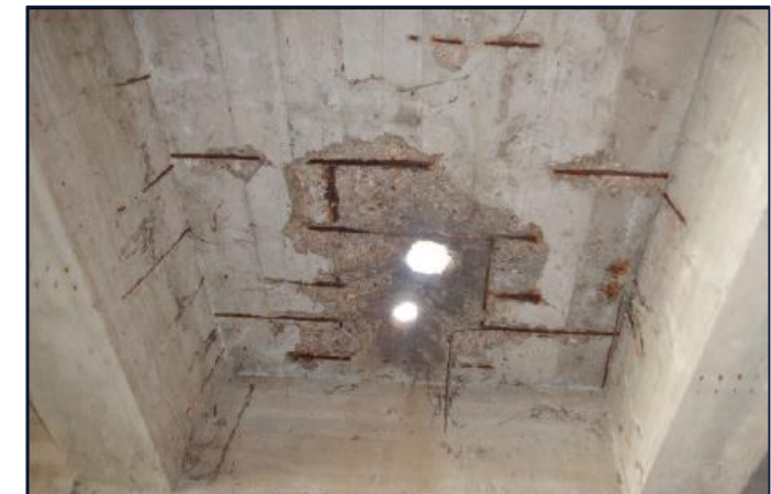
CD48, deck underside with holes and exposed reinforcing with severe corrosion