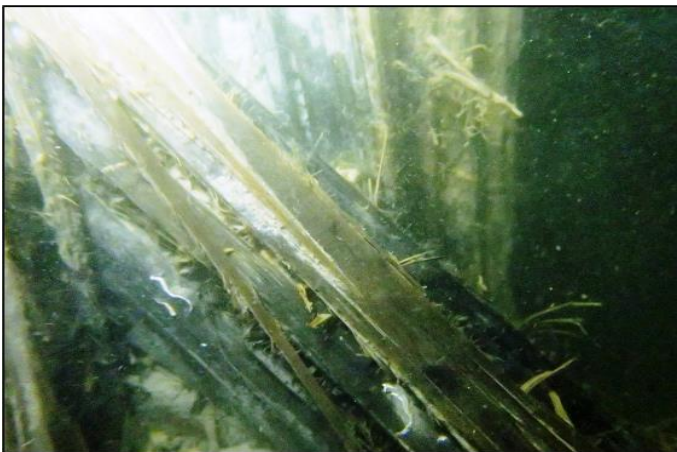
Timber pile with severe abrasion at waterline