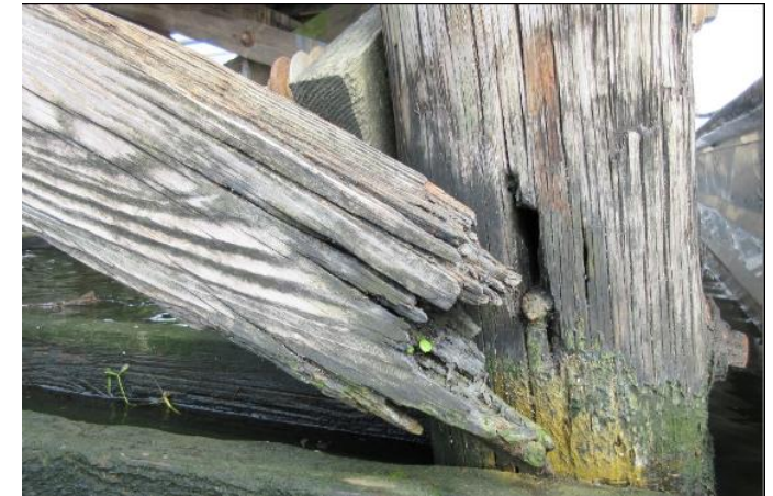
Timber brace with severe decay