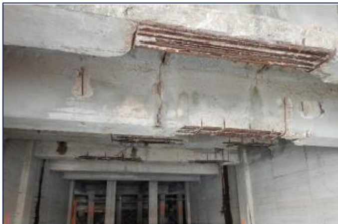
CD48, deck beams with severe cross-sectional loss due to corrosion