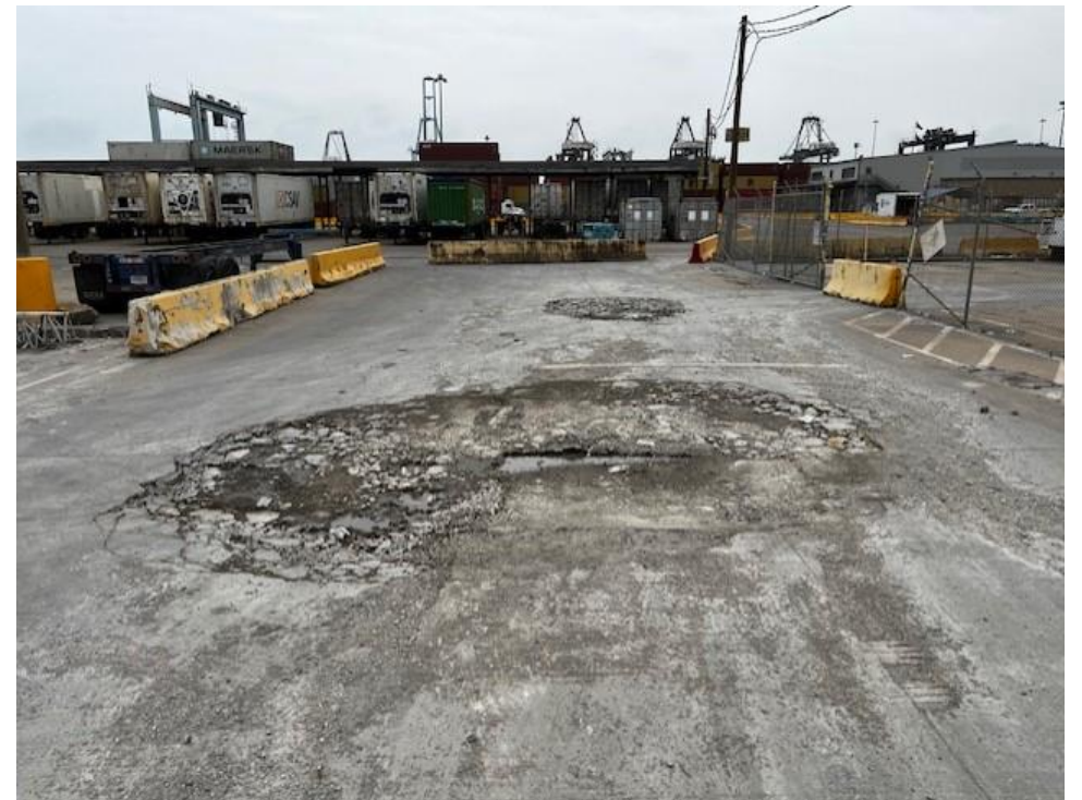
Img.1 - Typical Paving Condition Scenario