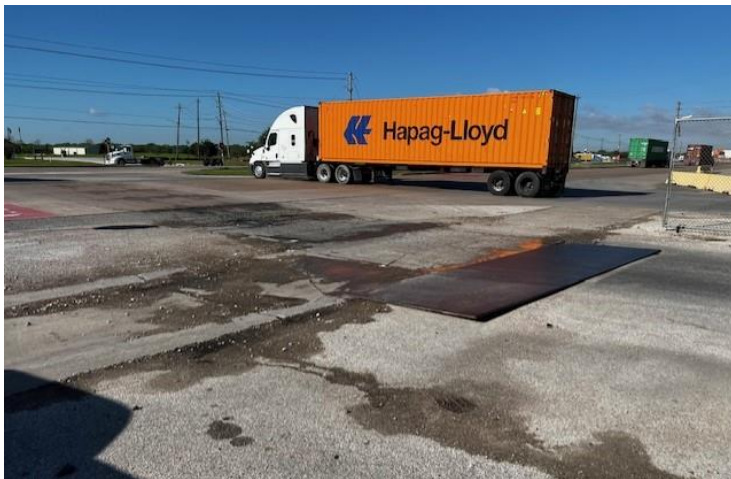
Img.2 to 4 - Damaged Paving